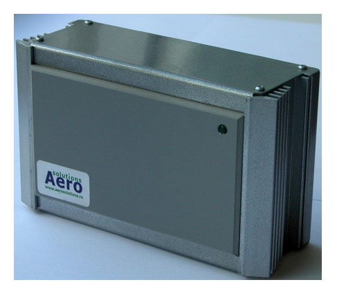
Figure 1 Example of an RFID reader (7)

The RFID reader can also write data to RFID tags, which will be useful for aircraft cabin implementation. The ability to write to tags allows the reader to log data on each tag. For example, maintenance history can be embedded on a tag, making it easier for mechanics to keep track of objects that need attention. High quality RFID readers can read up to a thousand active tags or hundreds of passive tags at the same time.