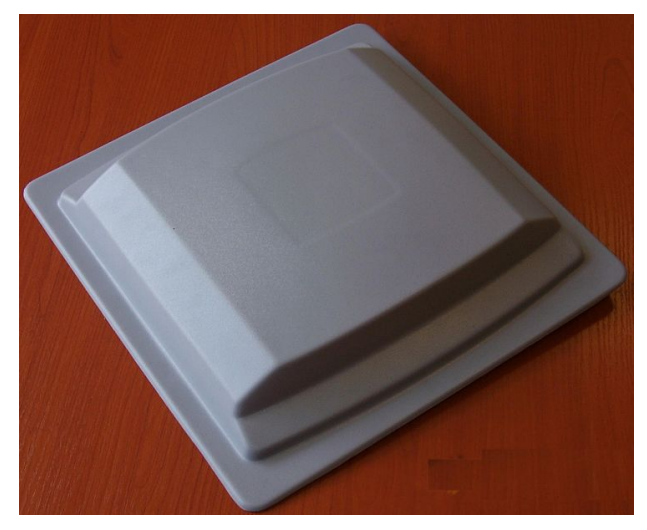
Figure 4 Example of an RFID antenna (7)

Antennae are designed to focus their power in one direction. Radiating power in one direction causes less power to be radiated in the opposite direction. Therefore, if the RFID implementation is to use one antenna, this antenna should be placed in the front of the aircraft or the rear of the aircraft. The reader should still be placed close to the antenna due to a phenomenon called cable loss, in which longer cables cause a loss in power between the antenna and the reader. Cables that connect the RFID reader to their antennae are governed by US FCC (part 15). (2) Some RFID readers use integrated antennae, and therefore antenna placement is not adjustable.