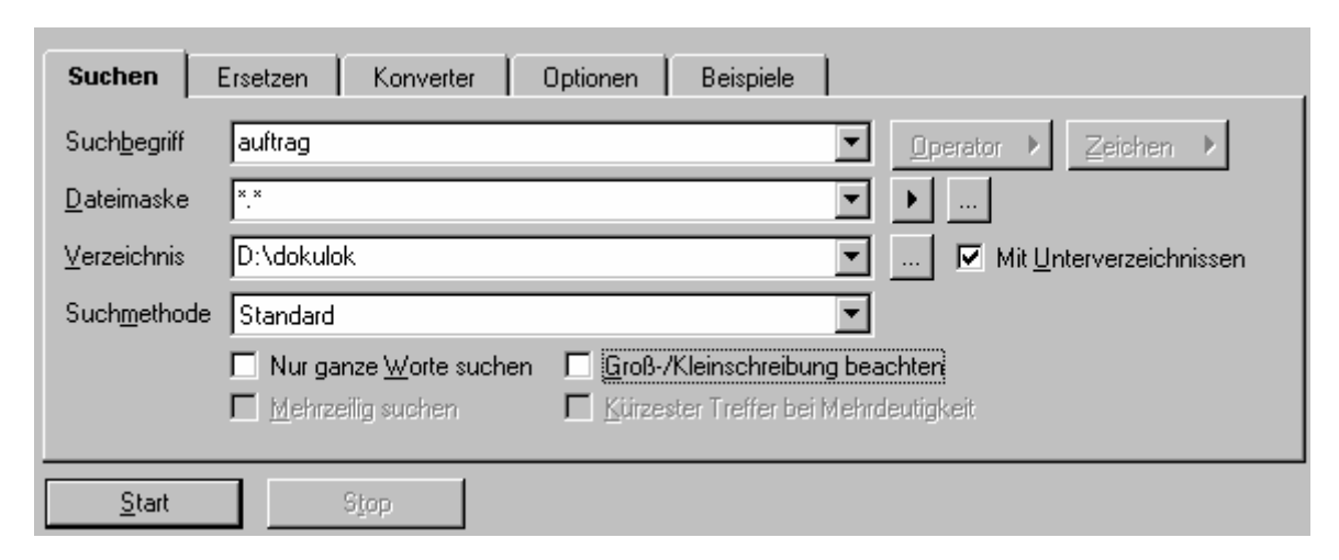
Figure 1 Search Dialog (Inforapid S&E Kurzanleitung)

The search function is the most important feature of the program. The search dialog can be activated with the ESC button or the right mouse button. Four search parameters can be set: